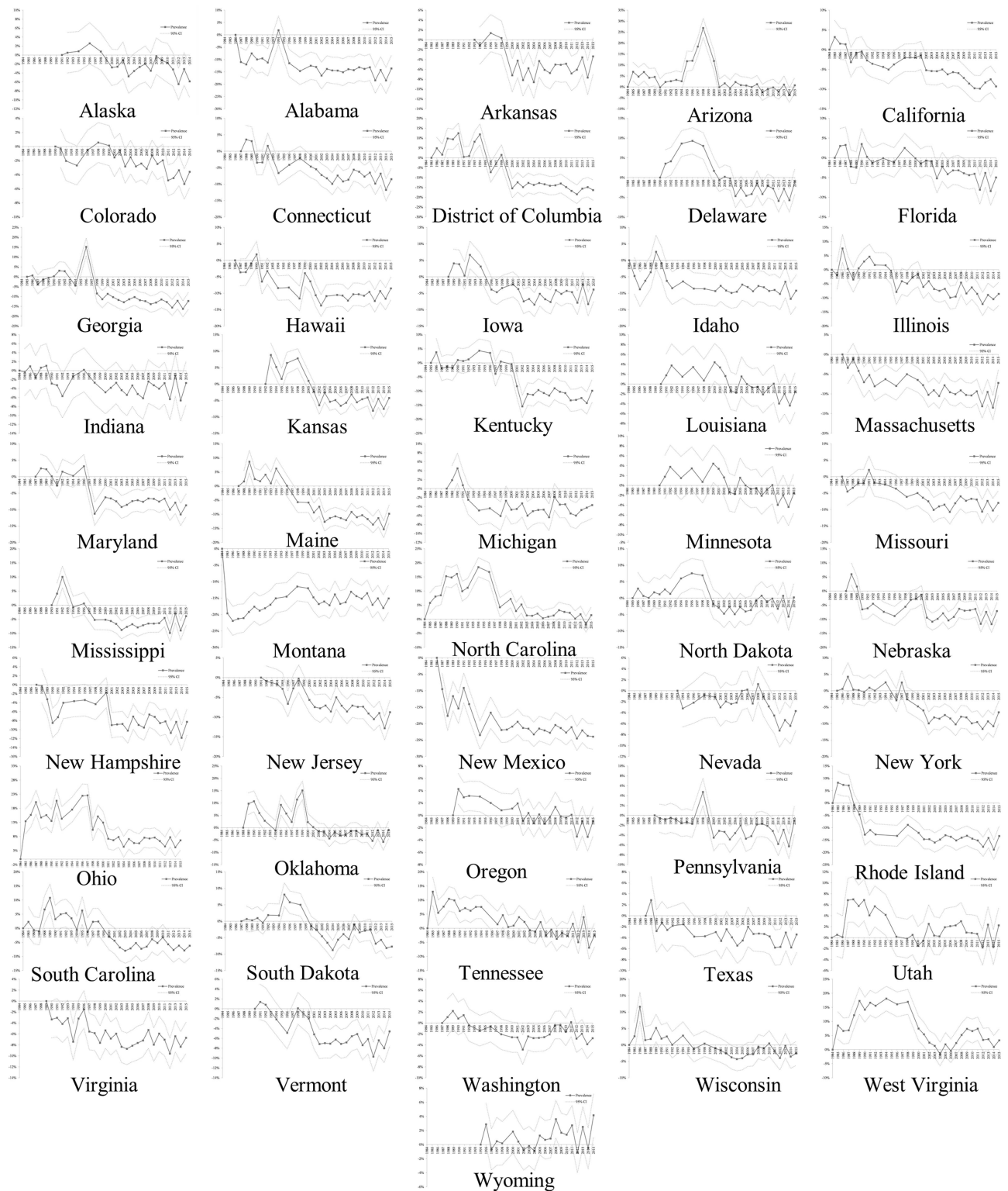
Fig 2. Regression-adjusted changes in the prevalence of leisure-time physical inactivity.